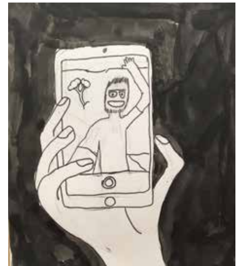
Reimagine M.C.Esher's art