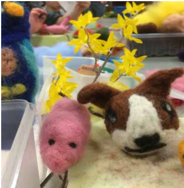
Displayed artworks in the class