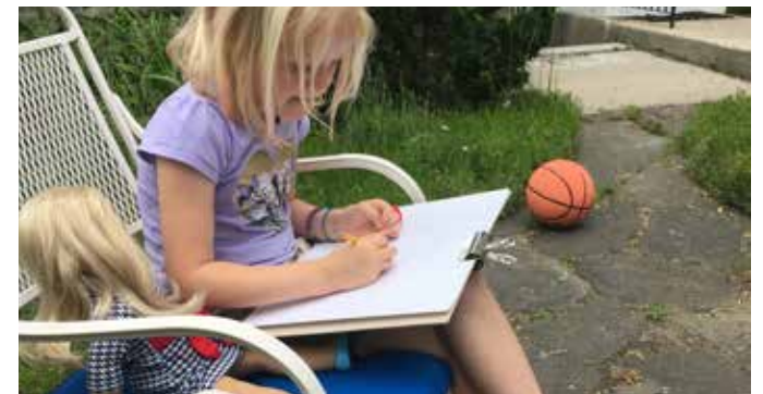
Sketching en plein air