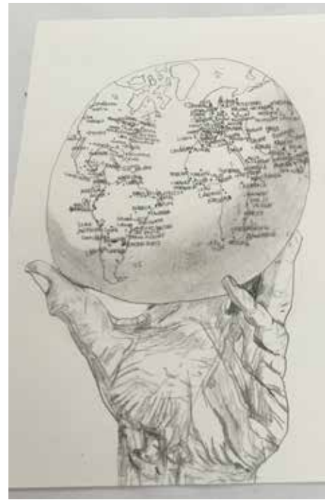
Illustration inspired by M.C. Escher