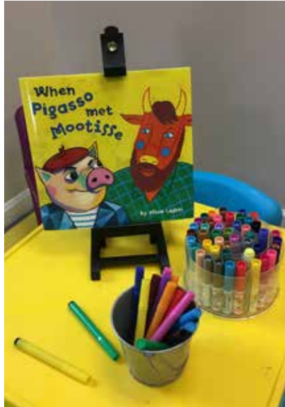
Art History for the youngest artists Gr. K-1