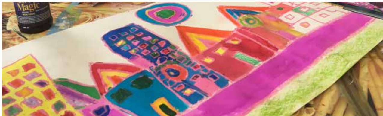
Where Kandinsky Meets Hundertwasser. Watercolors and oil pastels. Gr. 1-3