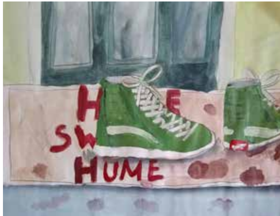
Paint everyday objects from observation (inspired by Van Gogh's shoes)