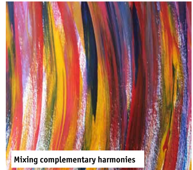
Mixing complementary harmonies