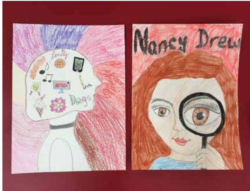
Illustrations for a poster. Gr. 3-6

In illustration class students learn how to transform words and concepts to pictures. The projects include: illustrating stories, developing characters, designing letters and drawing their own comic strips. Also, the students create their own books and "zines".