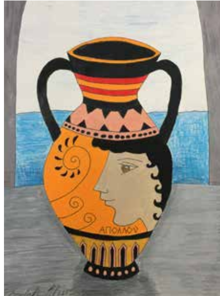
"Ode to a Greek Vase" Gr. 3-5