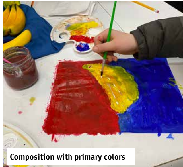
Composition with primary colors