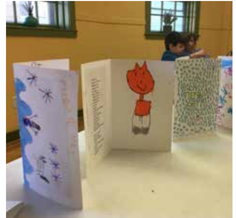
Poetry book design, children K-2