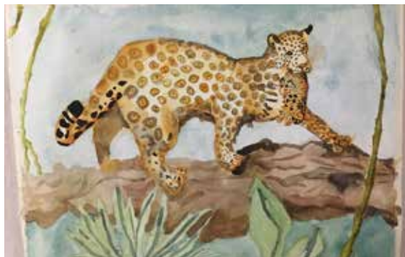
Visual storytelling with watercolors