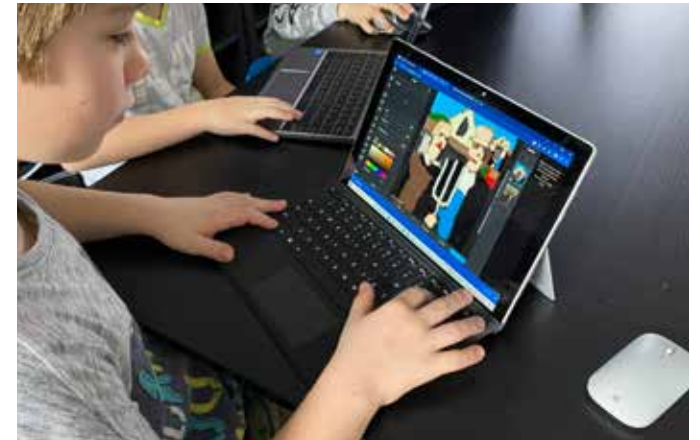
Recreating a famous painting in Digital Art class (5th Grade)