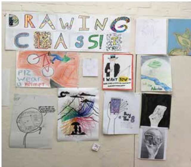
Displayed artworks in the class