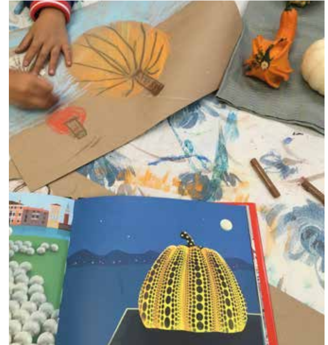
Learn about the art of Yayoi Kusama. Pastels, mixed media. Gr. K-2