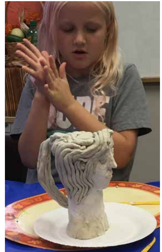
Study Roman heads, Belmont studio. Gr. 5