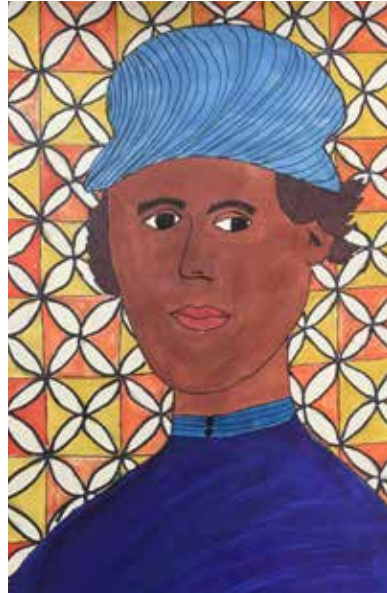
Della Francesca/Pop Art portraits. Gr. 5-7