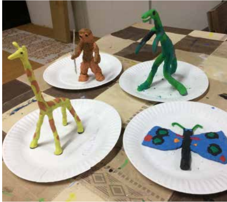
Study basic sculpting techniques, Gr. 1-3

Photos from the Needle Felting classes at Munroe Center for the Arts, Lexington, 2016-2018, Arlington Kid Zone, Arlington Ma, 2016-2017, Solomon Schechter Day School, Newton, MA, 2022-2023, and from art classes at my studio in Brookline and Belmont, 2018-2019.