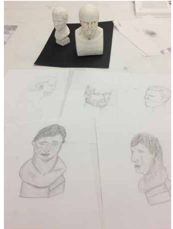
Classic drawing "atelier"