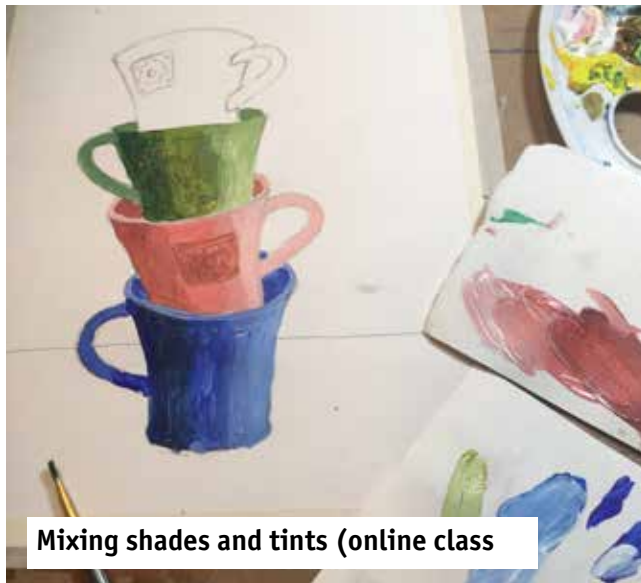
Mixing shades and tints (online class)