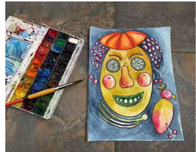
"Hello, Fruit Face!" Guiseppe Arcimboldo inspired project with watercolors and markers(mixed ages)