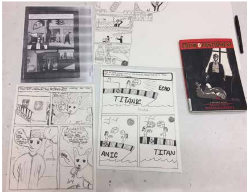
Comic book pages inspired by noir comics. Gr. 3-6