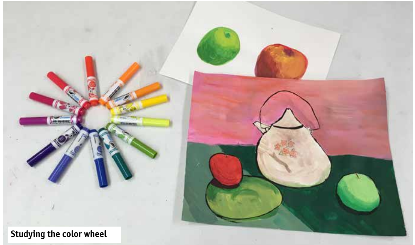
Studying the color wheel

In the classroom, we use acrylic paints, oil pastels, sometimes combined with wax crayons and watercolor pencils. It's a perfect way to experiment with materials.