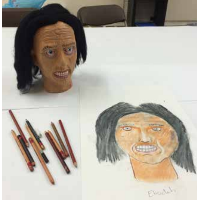
Head study/ Halloween theme

Observational drawing is an excellent way to help children learn to draw what they see. In order to draw something from reality, students need to know the principles, elements and steps of realistic approach to drawing, find the shapes, forms, gradations, etc. We work from real observation, explore samples of other artist's works and also draw from memory.