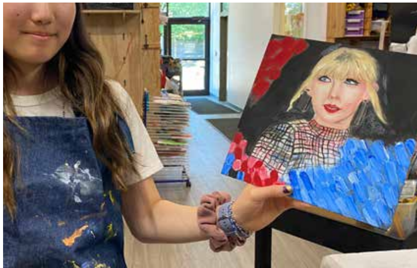
Painting favorite pop stars (Middle school)