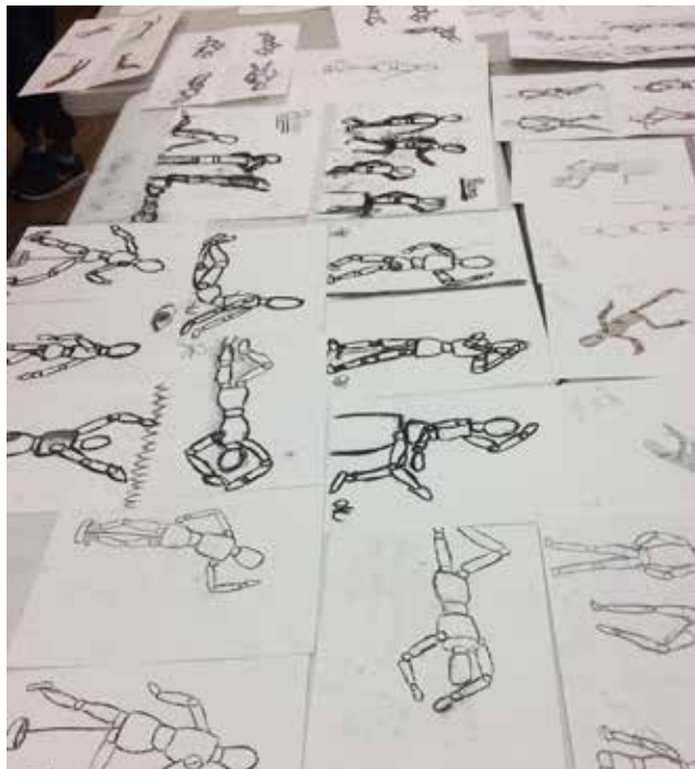
Gestural drawing of a mannequin