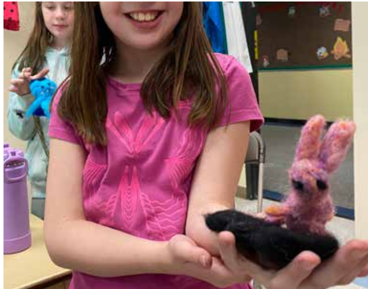
Needle Felting at Solomon Schechter Day School, Gr. 4-5