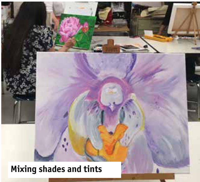
Mixing shades and tints