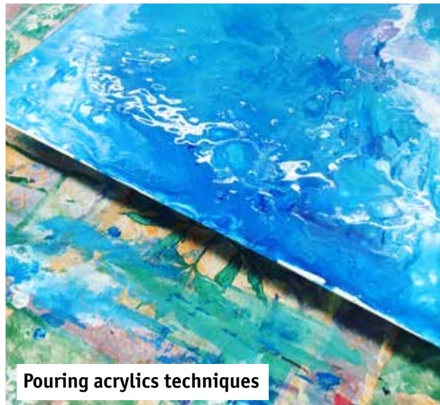
Pouring acrylics techniques