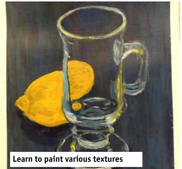
Learn to paint various textures