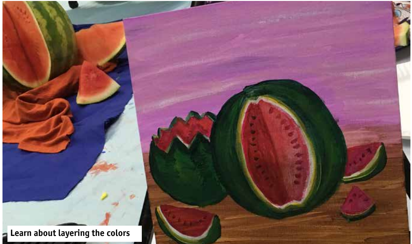
Learn about layering the colors

In the classroom, we use acrylic paints, oil pastels, and watercolors, sometimes combined with wax crayons and watercolor pencils. It's a perfect way to experiment with materials.